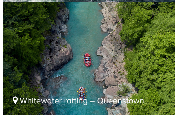
📍 Whitewater rafting – Queenstown