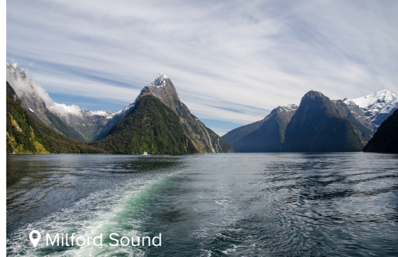
📍 Milford Sound