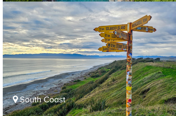
📍 South Coast