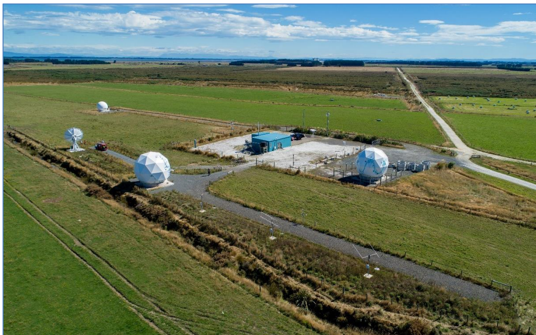
Figure 1. Awarua Satellite Ground Station, May 2018.

This Personnel Instruction provides a full site induction to personnel visiting Awarua Satellite Ground Station. It should be read by everyone visiting or working at the station, before travelling to the station.